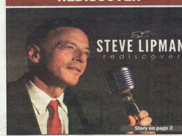
Story on page 2